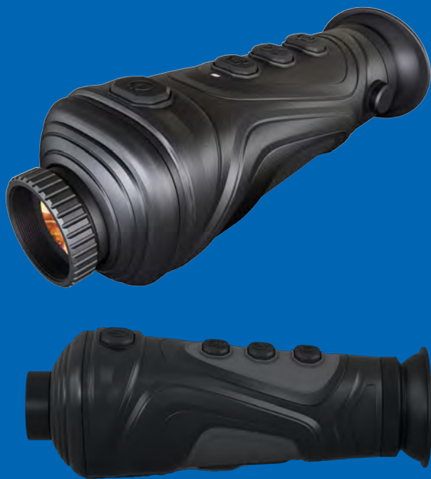
186L x 69H x 68W (mm)

The HT-A3 is an advanced hand held thermal image camera, with a dioptic adjustable, single eyepiece, that is intuitive, highly durable and easy to use device with a high resolution thermal sensor.